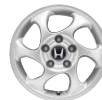
15" 6 Spoke Alloy 08W15 S2H 600F