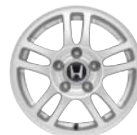
15" 5 Split Spoke Alloy 08W15 S2H 600