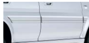
Body Side Mouldings Supplied primer coated black, can be painted body colour - as illustrated.