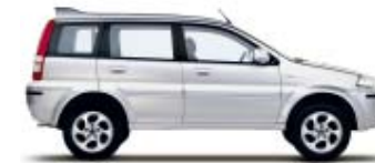
HR-V 5dr fitted with 15" 6 Spoke Alloy