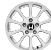
16" Multi Spoke Alloy 08W16 S4N 600