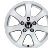
16" 7 Spoke Alloy 08W16 S2H 600