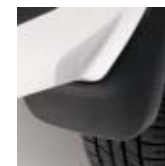
Mudflap Sets Front - 2 Pieces Rear - 2 Pieces