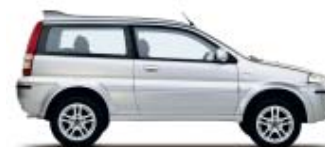
HR-V 3dr fitted with 15" 5 Split Spoke Alloy