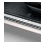
Door Step Garnish Chrome with HR-V logo. 3dr - 2 Pieces 5dr - 4 Pieces