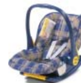
Infant Seat - 'Babysafe' 0 - 9mths (up to 9kg)

Produced by Römer Britax European, these child seats have been chosen with your child's safety in mind, specifically for the whole Honda car range in the UK. Covers are also available separately. For Child Safety all Honda Child seats are approved to ECE44/03 standards and can be secured into position by using either the vehicle's existing seatbelts or a supplementary fitting kit.