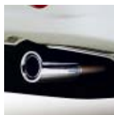
Exhaust Pipe Finisher

Soft Front Grille Guard This stylish feature has been wind tunnel tested to ensure it does not detract from the performance or handling of your HR-V. (primer coated black - can be painted to body colour)