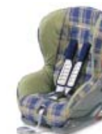
Toddler Seat - 'King' 9mths - 4yrs (9 - 20kg)