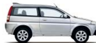
HR-V 3dr fitted with 16" 7 Spoke Alloy