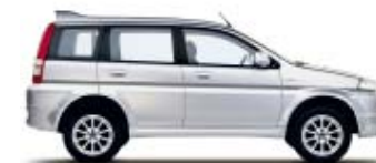
HR-V 5dr fitted with 16" Multi Spoke Alloy