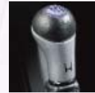
Silver Alu look & Leather (MT)