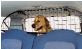
30 Dog Guard (3 & 5 door) An innovative and superior mesh design of robust and sturdy construction to protect your cabin area. (5 door available August)