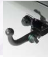
40 Detachable Trailer Hitch with 7 Pin Trailer Harness Designed to strategically disperse the towing load into the Honda car chassis, giving maximum safety and stability. Honda towbars do not require a stabiliser, unless personal preference dictates it. Honda recommend only genuine Honda towbars are fitted to Honda cars.

The Honda range of Touring accessories can suit the needs and preferences of your favoured leisure activities. However you spend your leisure time - cycling to skiing or taking your family and pets on holiday, the Honda range of products will be more than useful. All the accessories have been stringently tested and chosen for their quality of manufacture, making them the safest and most efficient to use. All touring products are of the highest quality offering competitive genuine value. Honda prefer not to offer low quality, low price systems as Genuine Honda options, but offer high quality at affordable prices. Quality is particularly important when considering any touring or external transport / stowage equipment for your car.