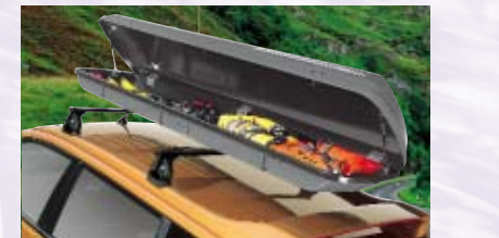
41a Ski Box H31cm x W50cm x L220cm (320 Litres) Provides the user with an easy way to transport extra luggage being aerodynamic and waterproof, highest quality with internal support struts. (for use with base carrier) (colour coded + £175.00)