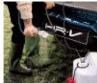
32 Shower Attachment (Not including Water Barrel)