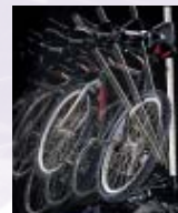
44 Bicycle Lift Lever spring action eases the strain of lifting a bicycle onto the roof of your HR-V. (max. 2 per car)