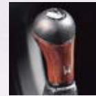
Wood & Leather (MT)