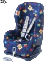
38 Toddler Seat - 'King' 9 mths - 4 yrs (9 - 20 kg)