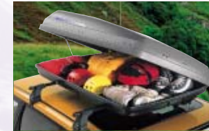
41 Roof Box H33cm x W90cm x L150cm (350 Litres) Provides the user with an easy way to transport extra luggage being aerodynamic and waterproof, highest quality with internal support struts. (for use with base carrier) (colour coded + £175.00)