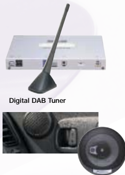
Digital DAB Tuner