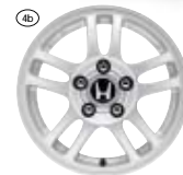
15" 5 Double Spoke Alloy