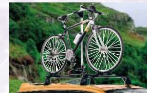
45 Bicycle Attachment Upright roof transportation provides the best load fixture and is the most secure way of transporting your bicycles. (max. 3 per car)