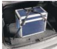
33 Boot Tie-down Straps