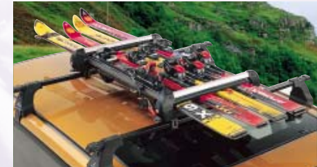
42 Base Roof Carrier - cross bars Honda base carriers are designed specifically for each model roof and gutter profiles. Fit will be perfect offering maximum security of load fixture. (Base Carrier Lock Sets are available)