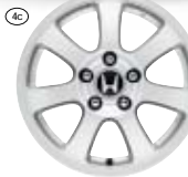
16" 7 Spoke Alloy