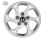
15" 6 Spoke Fan/Twist Alloy

Lightweight and stylish, these alloy wheels will enhance the appearance and being lightweight, also the driving characteristics.