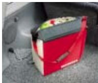
34 Cooling Box Fridge Cooler box for food and drink, plugs into the auxiliary outlet or cigarette lighter socket. Chills to 4°C, fridge temperature, to a maximum of 25°C below the ambient temperature.