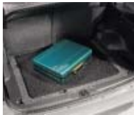
31 Boot Anti-slip Mat