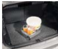
36 Multi-Fix - Boot Orderly