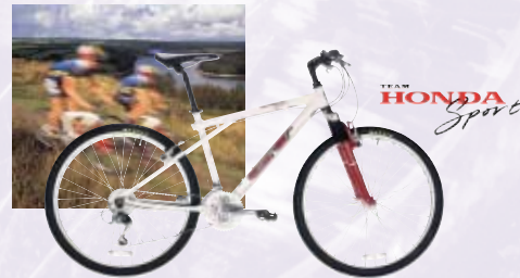
47 Team Honda Sport GT Mountain Bike - Limited Edition Front suspension and Trigger gear change are just two features of this superb product. Built for Honda by world leading manufacturer GT bikes, finished in the Team Honda Sport colours to match the Millennium Season Accord Touring Car. Available in: 14" Child's, 16" Midsize Mens/Ladies 18" Mid Mens & 20" Large Mens