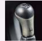
Titanium look & Leather (MT)