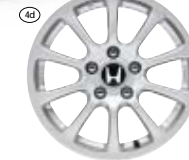
16" 10 Spoke 'Rogue' Alloy