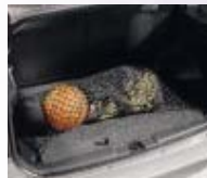
38 Boot Utility Net