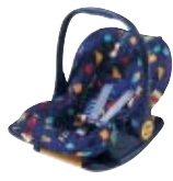
37 Infant Seat - 'Babysafe' 0 - 9 mths (up to 9 kg)

Produced by Römer Britax European, these child seats have been chosen with your child's safety in mind, specifically for the whole Honda car range in the UK. Covers are also available separately.